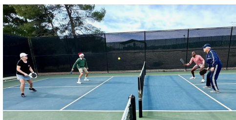
Christmas Day Pickleball at Livermore Downs