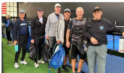
TVPC members playing at The Hub in Alameda