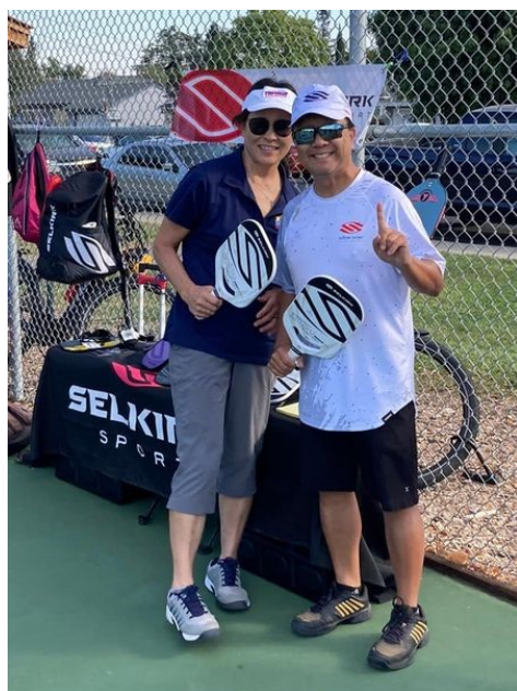
Selkirk Demo Days October 2023 at May Nissen