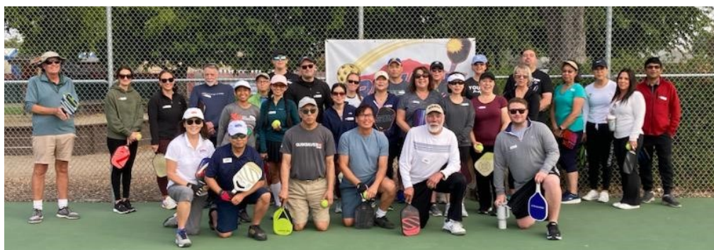
Introduction to Pickleball class on October 14, 2023