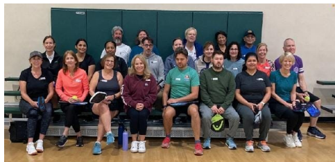
LARPD Pickleball 101 November 18, 2023