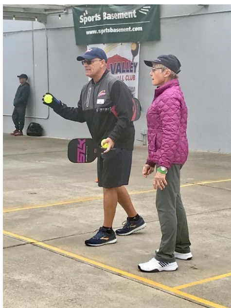
“Picklefest” at the Sports Basement in San Ramon