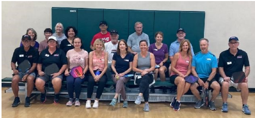
LARPD Pickleball 101 October 21, 2023