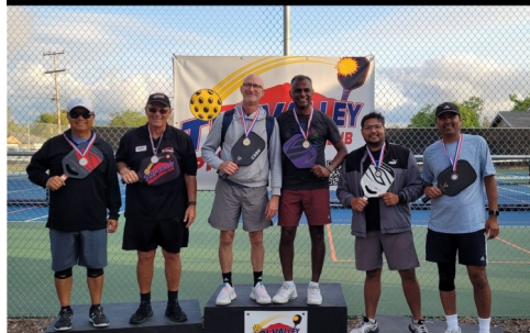
Tri-Valley Pickleball Club's Round Robin Tournament Men's Doubles 3.5 - May 2023