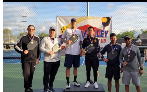
Tri-Valley Pickleball Club's Round Robin Tournament Men's Doubles 4.0 - May 2023