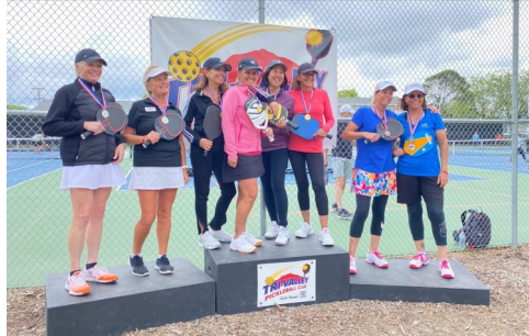
Tri-Valley Pickleball Club's Round Robin Tournament Women's Doubles 3.5/4.0 - May 2023