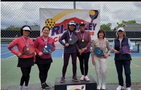
Tri-Valley Pickleball Club's Round Robin Tournament Women's Doubles 2.5 - May 2023