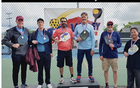
Tri-Valley Pickleball Club's Round Robin Tournament Men's Doubles 3.0 - May 2023