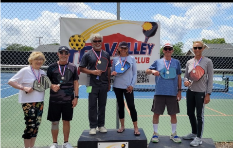
Tri-Valley Pickleball Club's Round Robin Tournament Mixed Doubles 3.0 (55+) - May 2023