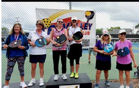
Tri-Valley Pickleball Club's Round Robin Tournament Women's Doubles 3.0 - May 2023